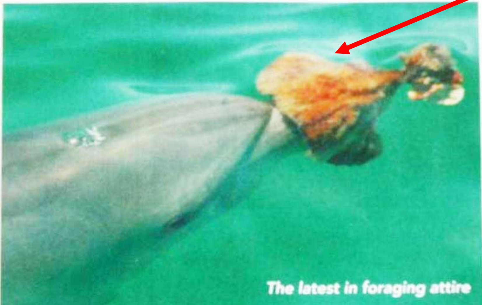
Bottle Nose Dolphins in Shark Bay Australia, Natural History, p12, September 2005