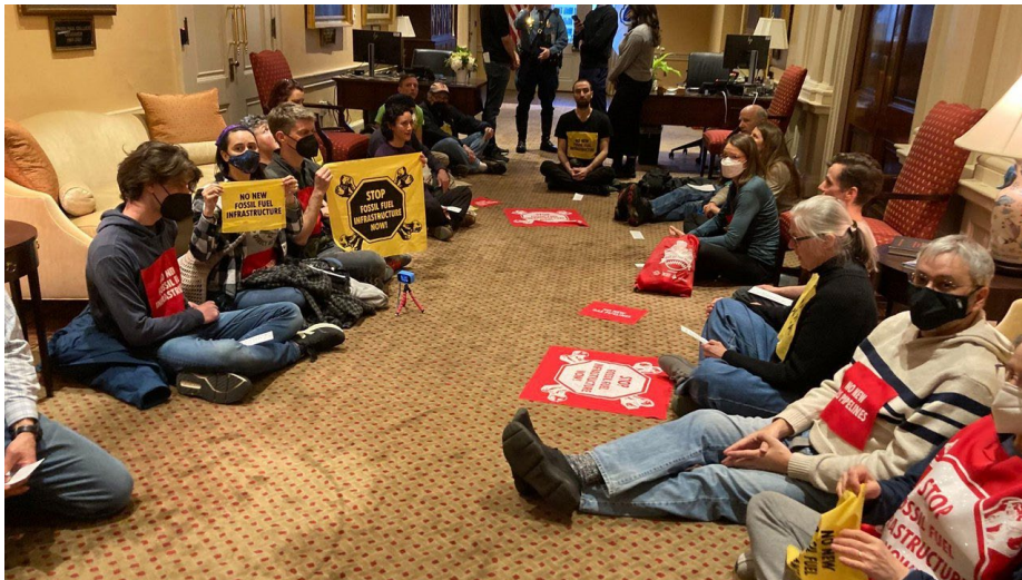
XR Boston Stages State House Sit-In, Demands Governor Healey Ban New Fossil Fuel Infrastructure

XR Boston Stages State House Sit-In , Demands Governor Healey Ban New Fossil Fuel Infrastructure (February 10, 2023)