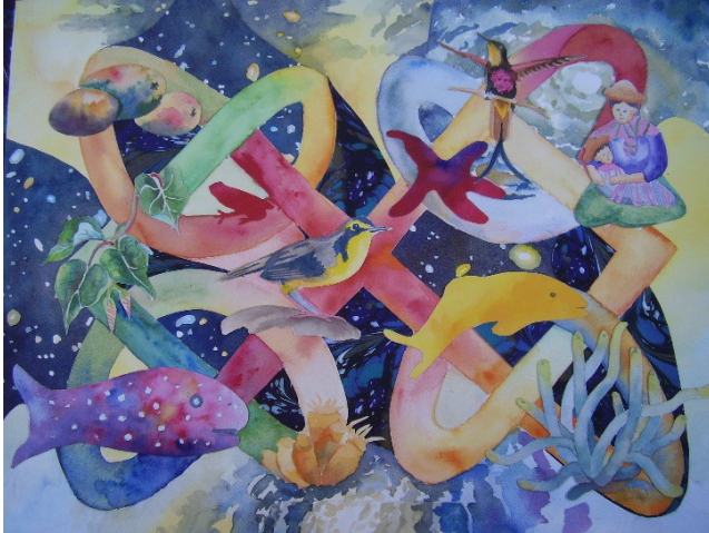
3. On Going Creativity of the Cosmos

identity) and in communion (interrelatedness, interdependence, mutuality). v