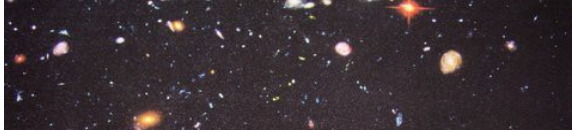
1 The Cosmos