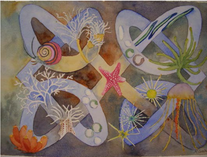
10 Magnificent Cosmos