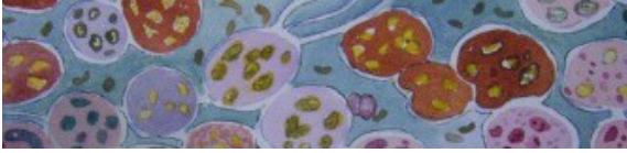
6 Unexpected Interconnectedness (Detail)

One of the strengths that Quakers bring to this challenge is our group decision-making process. The Quaker process goes beyond voting or reaching consensus. In a Quaker meeting the worshippers wait in openness to the Spirit. A “gathered” meeting is one in which the group senses a shared mystical experience. Likewise, our meetings for business, based in worship, seek a truth that lies beyond individual definitions. This process, though often slow, is a method of finding the shared, higher intelligence of the group called the “sense of the meeting.” Out of this practice have appeared revolutionary ideas and spirit-led actions.