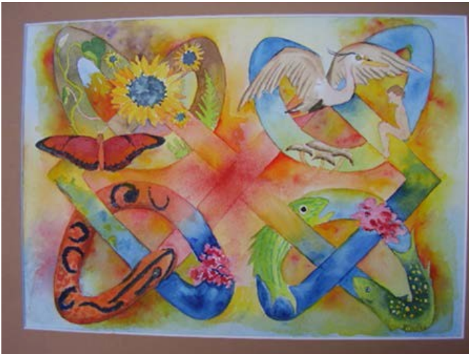
7 The Unfolding Light

Western civilization perpetuates a powerful underlying assumption: the separation of the material from the spiritual. The cultural heritage that most of us share casts