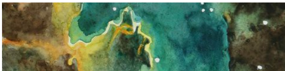
2 Star Formation (Detail)

One bridge between the science story and the religious story is the recognition of directionality in evolution now accepted by some scientists. There has been a remarkable increase in complexity of matter in the universe since the “Big Bang” 13.8 billion years ago—an increase also evident in the seamless, unending chain of biological events on earth. Some scientists believe that the universe would not have progressed beyond complex molecules in these 13.8 billion years if all change were only random. iii This assumption of directionality sharply contradicts the neo-Darwinian insistence that change results only from random events—a view that dangerously and tragically undermines individual agency and significance.