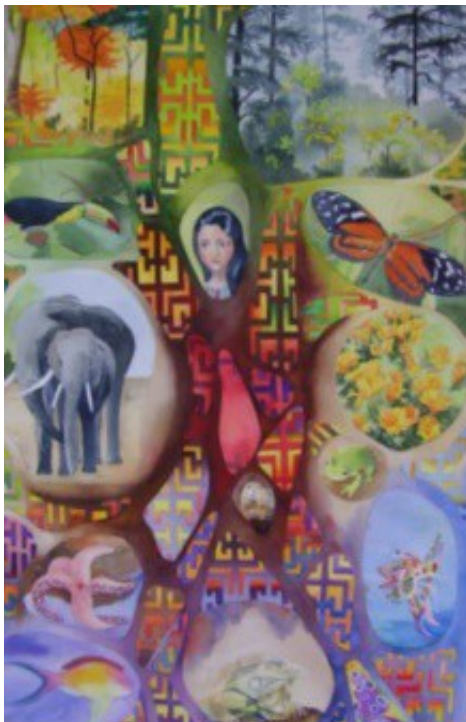
5 Tree of Life

Traditional, dualistic religions have struggled with the concept of Jesus as both human and divine. Panentheism removes this dichotomy. Central to our Quakerism is the belief that each of us carries the divine in us. We see Jesus as more completely integrated with the divine, and therefore demonstrating the highest human potential. In the context of science, the human species is evolving. In the context of the Quaker way and a New Story, Jesus is an evolutionary figure, revealing direction for the human species.